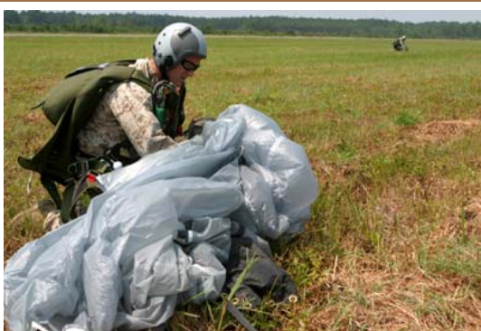
■ MARINE CORPS BASE CAMP LEJEUNE, N.C. – A Marine with U.S. Marine Corps Forces, Special Operations Command gathers up his parachute after descending from the MH-47D Chinook helicopter from the Army’s 160th Special Operations Aviation Regiment at Drop Zone Pheasant here, August 6.