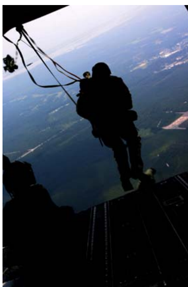
■ MARINE CORPS BASE CAMP LEJEUNE, N.C. – A Marine with U.S. Marine Corps Forces, Special Operations Command drops from the ramp of the MH-47D Chinook helicopter from the Army’s 160th Special Operations Aviation Regiment over Drop Zone Pheasant here, August 6.